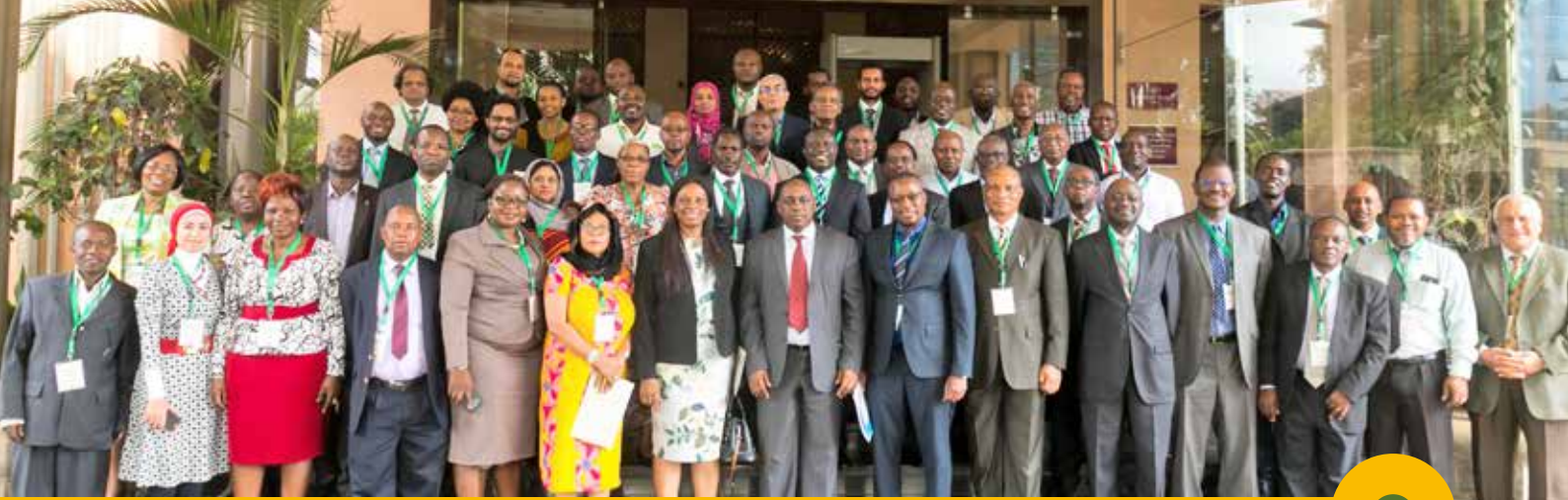
High-level Participants at the workshop on Harmonization of Seed Regulations within COMESA