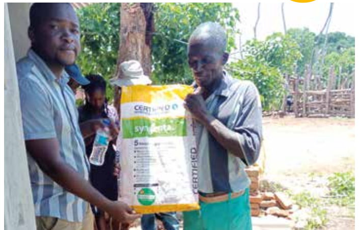
Agro-input dealer accreditation ensures delivery of quality inputs to farmers and minimizing of fake inputs