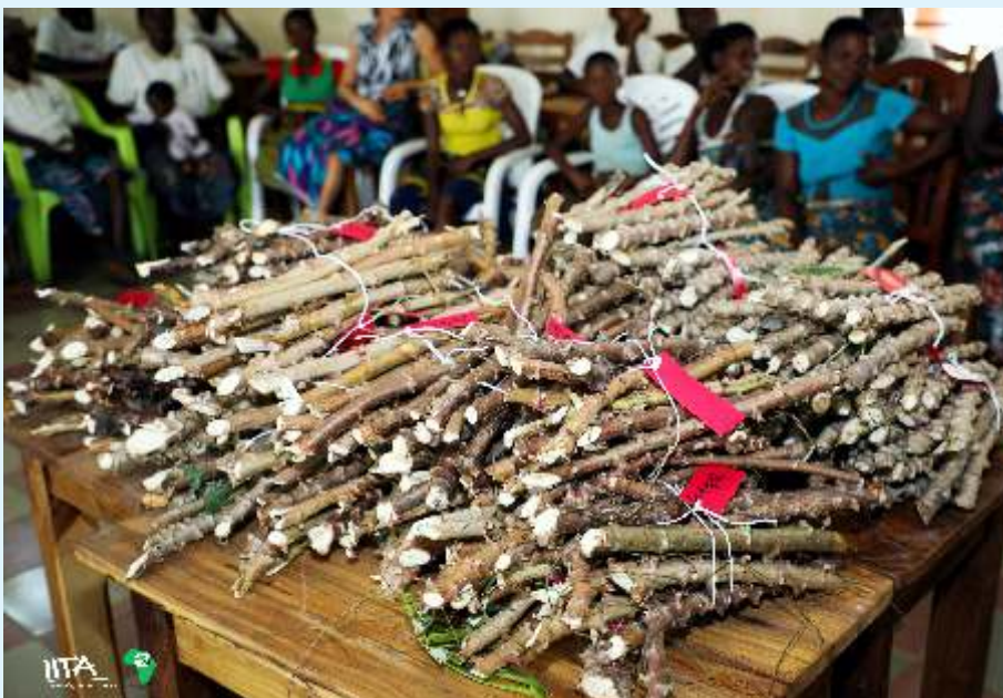
Yellow-fleshed cassava cuttings

The planting materials were multiplied to provide 200,000 cuttings, distributed to seed growers and farmers in selected villages such as Massi, Akouègba in Glazoué, Houèdo in Abomey-Calavi, and Tatonnoukon in Adjohoun, Allada, Niaouli, Attogon, Lotodonou, Agon, Sakete 1, Sakete 2, Houmbo, Daagbe, Djedje, Chada, Hego, Adodo, Ifangni, Sahorot-Nagot, Adanmanyi, Dagba, Meke, Dagbaou, and Yoko.