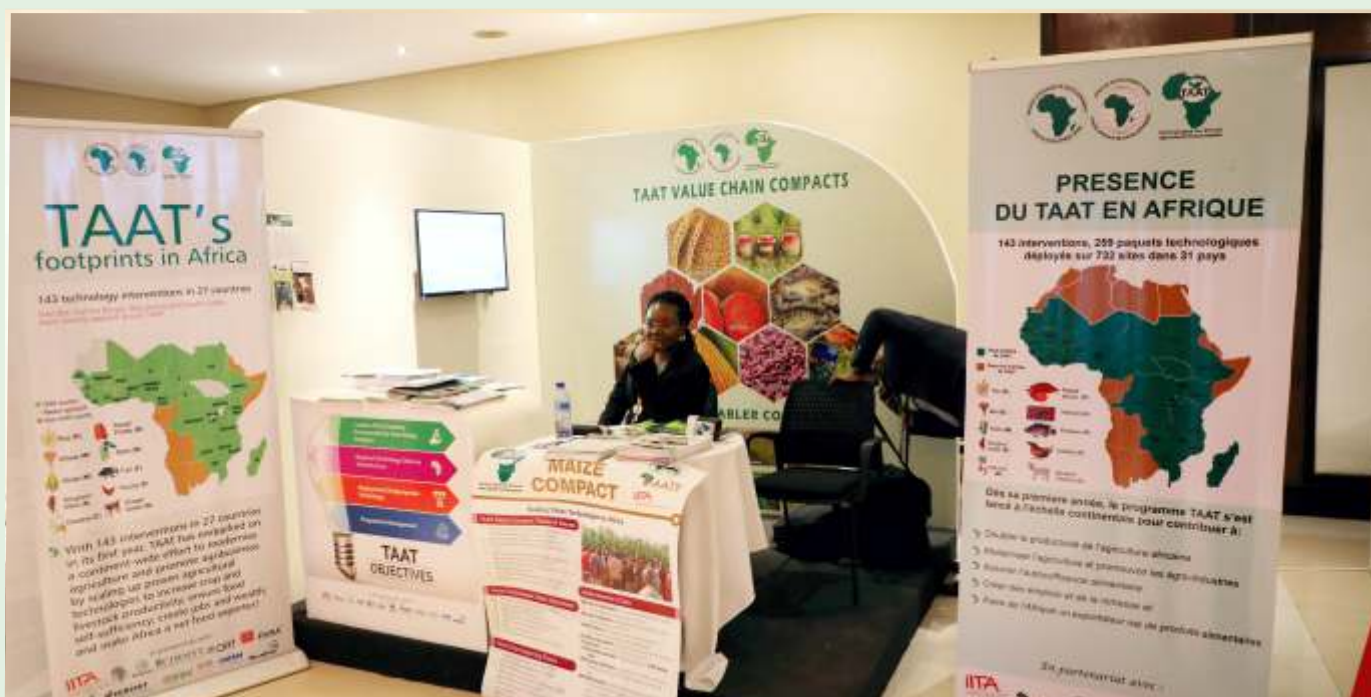
TAAT @ AGRF2019

Technologies for African Agricultural Transformation (TAAT) has restated its commitment to scaling proven technologies capable of driving digital growth in African agriculture.