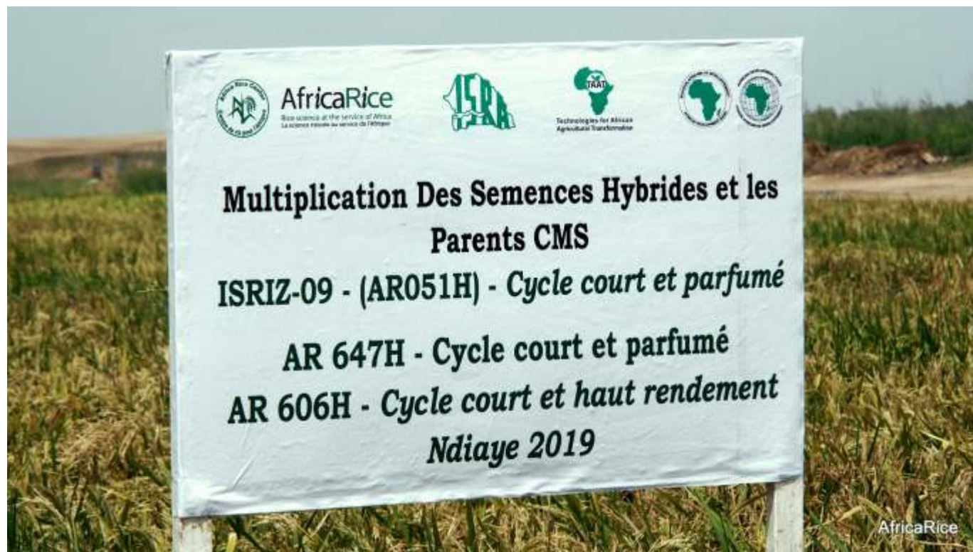
The consumer-preferred hybrid, ISRIZ-9