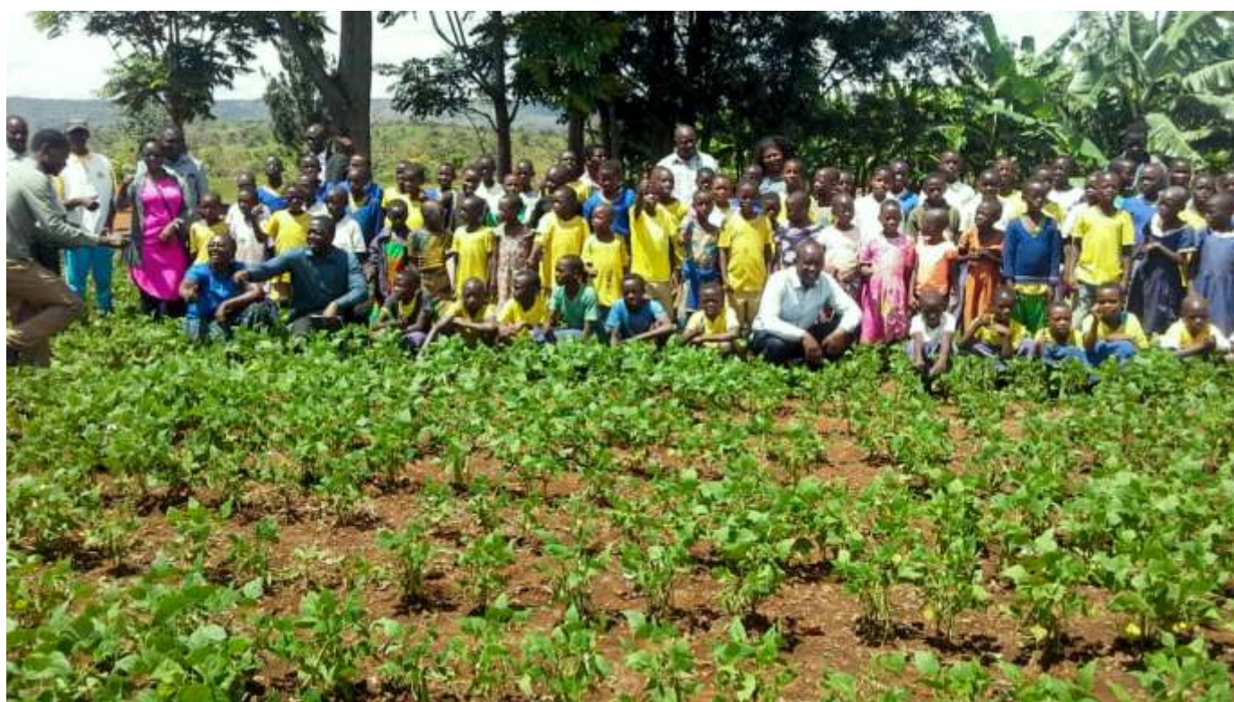
Demonstration site at a primary school in Nyaga District, District, Kagera Region, Tanzania

A large proportion of school children suffer from malnutrition, adversely affecting their physical growth and cognitive ability to learn.