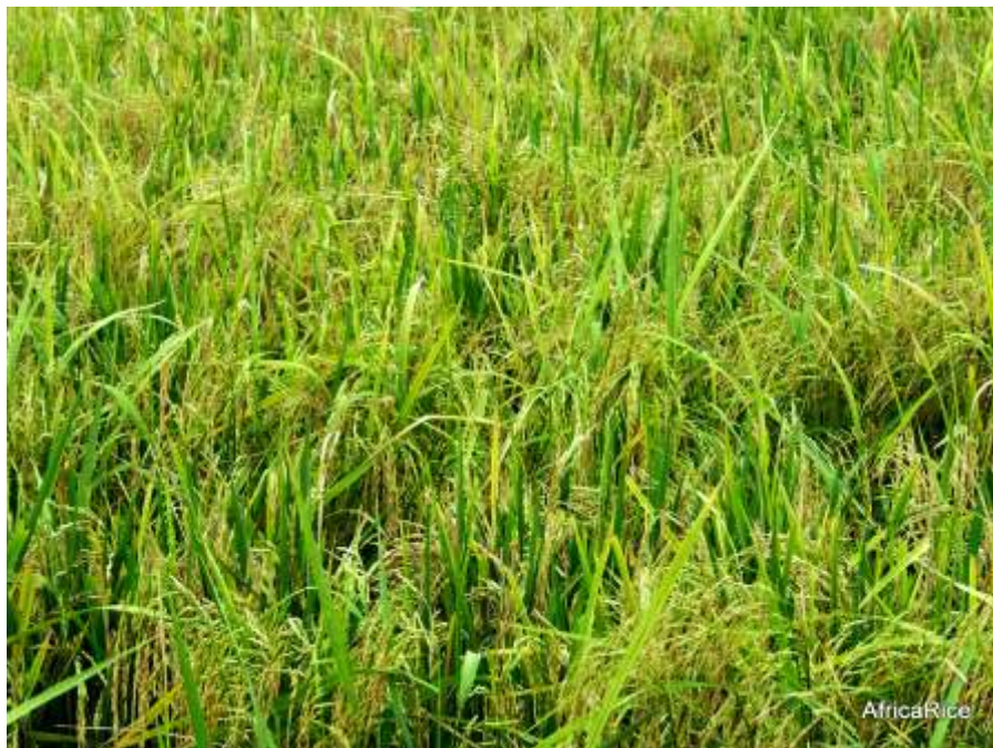
Hybrid rice varieties are released by TAAT in Africa following a decade of breeders' efforts (insert: a new variety on display).

Founder/Director of the FEPRODES women rice producers' association in Saint Louis, remarked, "While research is continuing to develop productive rice varieties and hybrids like these, we farmers and seed producers must also adopt these new technologies, so that we can reduce rice imports and make our country self-sufficient in rice."