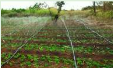
TAAT Partners IWMI & CIP to promote high-quality vine production in Malawi Story on Page 11