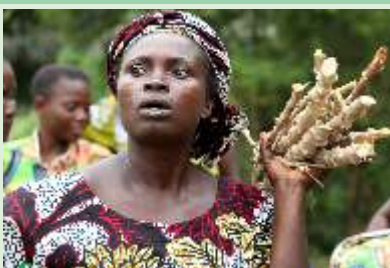
TAAT Excites Beninese Farmers with Pro Vitamin A Cassava Story on Page 5