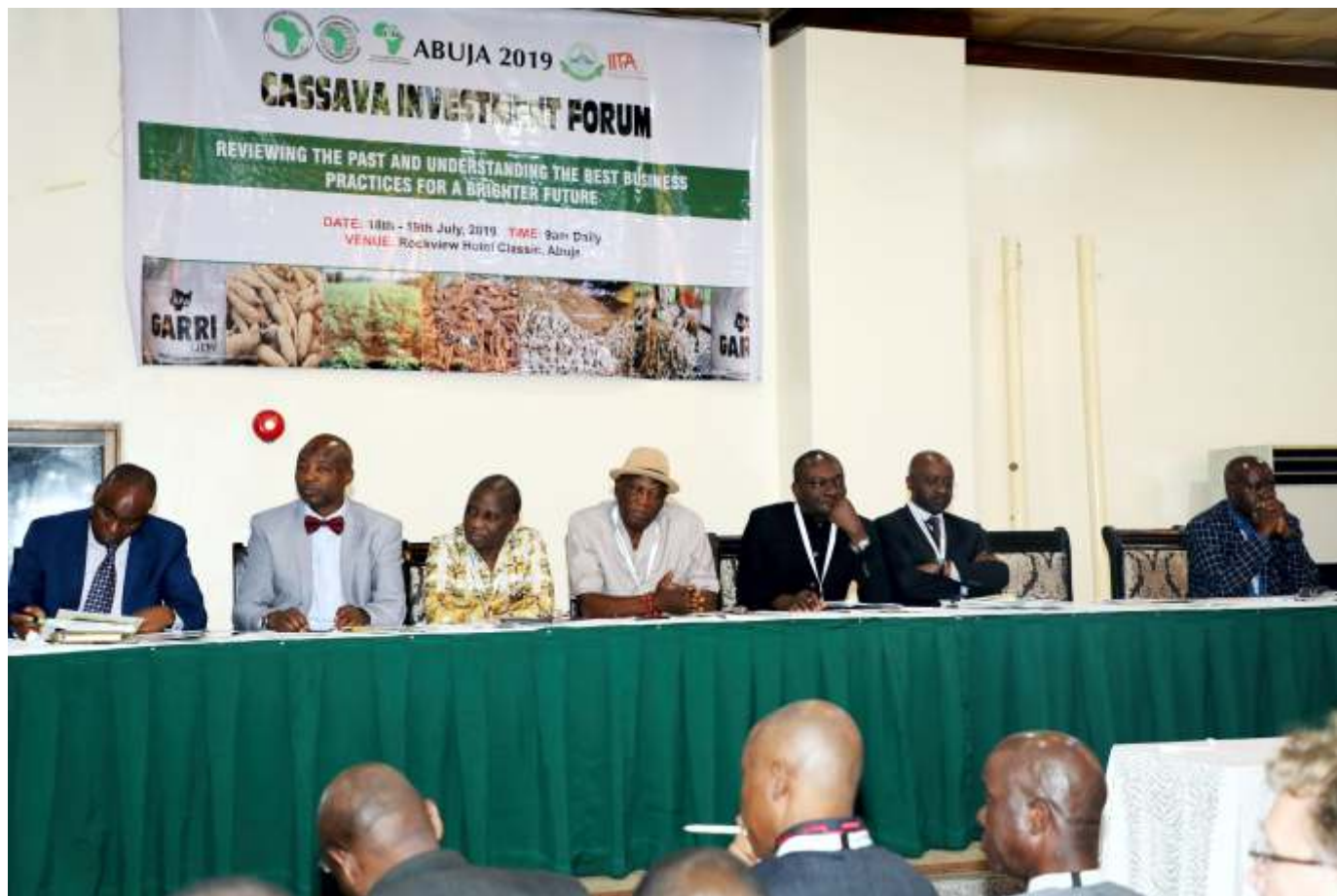
A view of the hightable at the investment forum in Abuja

A new initiative by the African Development Bank (AfDB) is unleashing the potential and power of cassava across the African Continent, creating wealth and improving the livelihoods of farmers, and taking cassava to a new frontier.