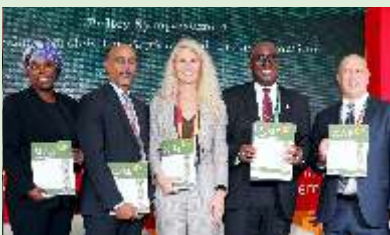
African Development Bank unveils Scale Up Source book Story on Page 9