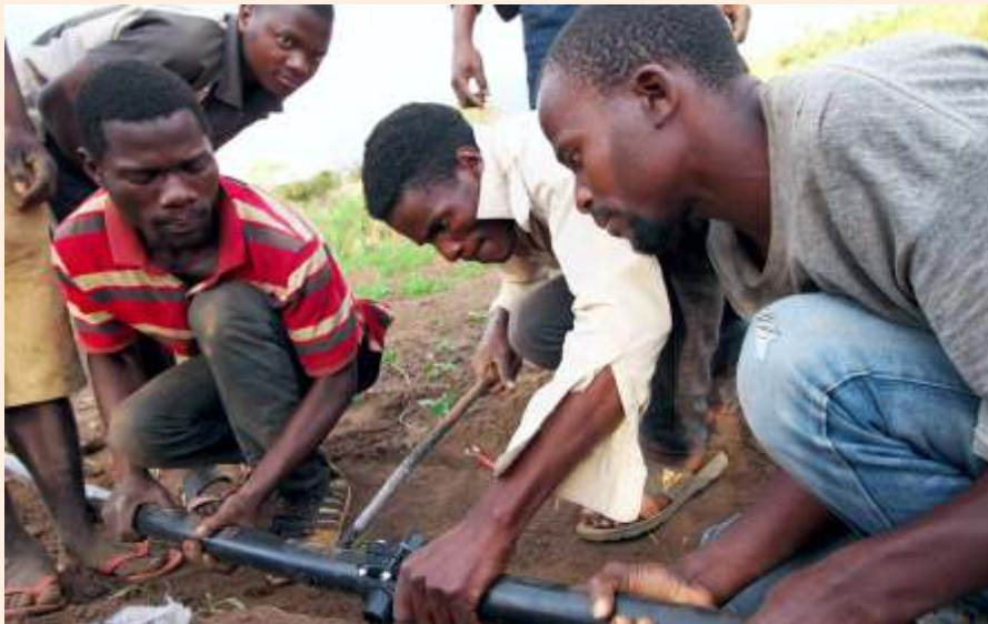
OFSP vine producers in Malawi receive on-the-job training in installation of irrigation equipment

technology toolkit capable of driving improvement in farmers' productivity," he said.