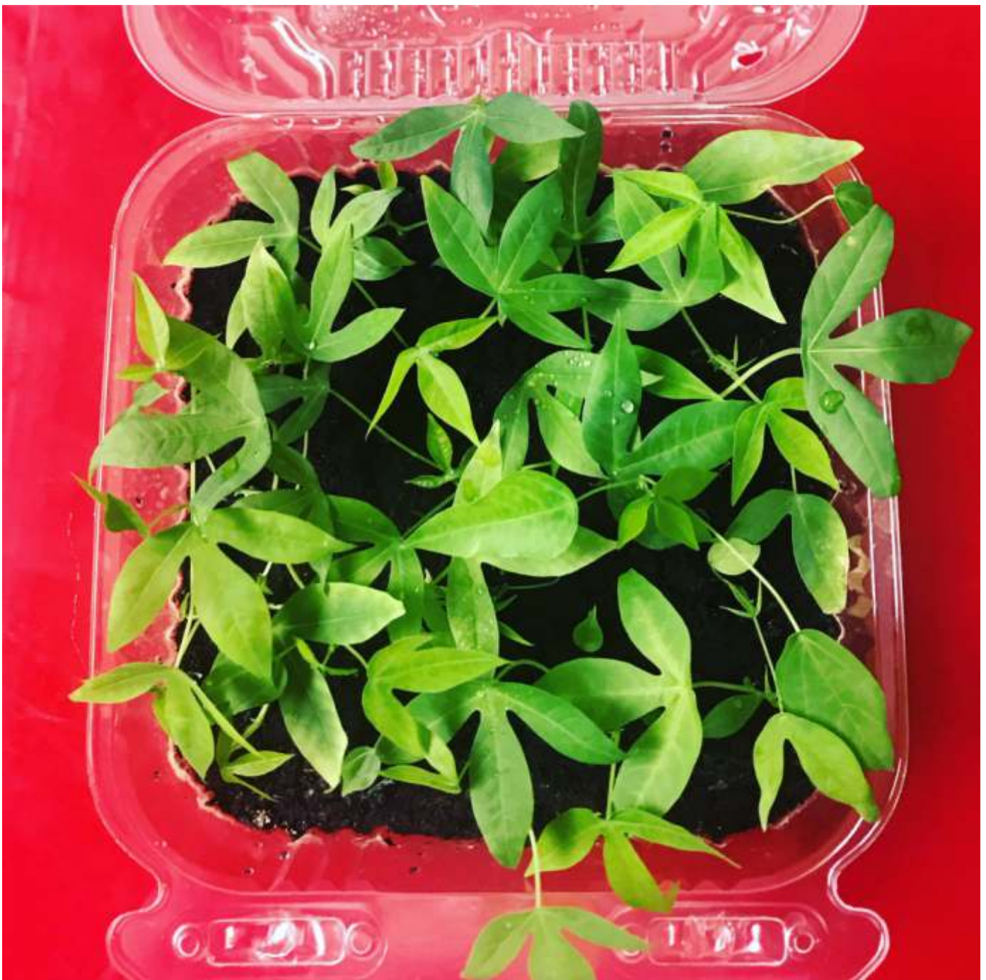
Healthy and disease-free cassava plants of Kiroba ready for field planting

team involved both laboratory and field techniques to ensure a successful implementation by the trainees upon return. Licenses were obtained from SAHtechno for the use of the SAH technology in the five countries.