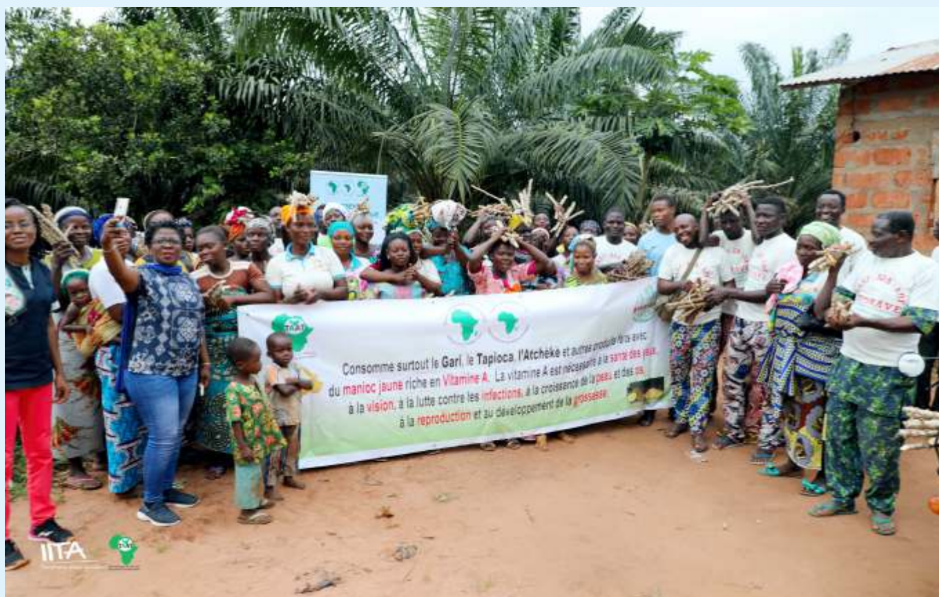
Happy farmers after receiving the yellow-fleshed cassava stem cuttings

TAAT is about boosting the productivity of African farmers in order for Africa to feed itself and through this set of varieties that we are distributing today, you are guaranteed an increased cassava yield up to an average of 25 ton/ha," Ms Adetunji said.