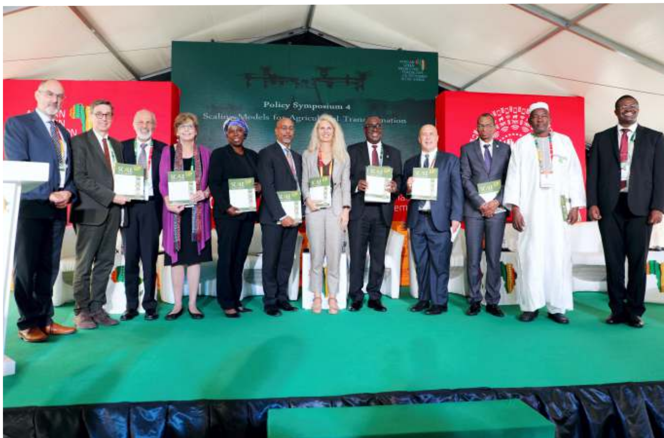
The Bank’s Vice President flanked by other panelists during the presentation of the book

The Scale Up Sourcebook is set to accelerate initiatives that in turn scale up agricultural innovations such as TAAT and many more.