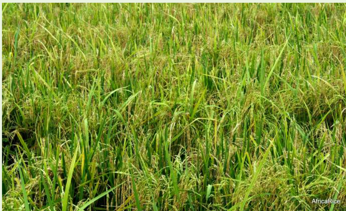
A view of the hybrid varieties

About 50 high-yielding hybrid rice lines/varieties have been developed by AfricaRice and evaluated in several African countries. The four hybrids showcased during the field days are part of this set.