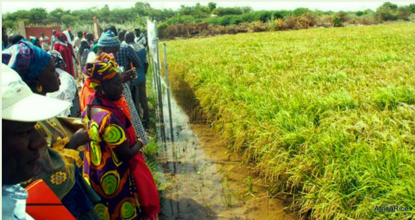
Participants at the field day

A set of four high-yielding hybrid rice varieties with excellent grain quality have elicited strong interest from key stakeholders, especially seed companies and farmers.