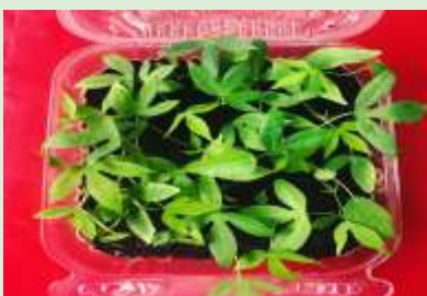
How TAAT is strengthening the cassava Seed sector through Technology transfer Story on Page 15