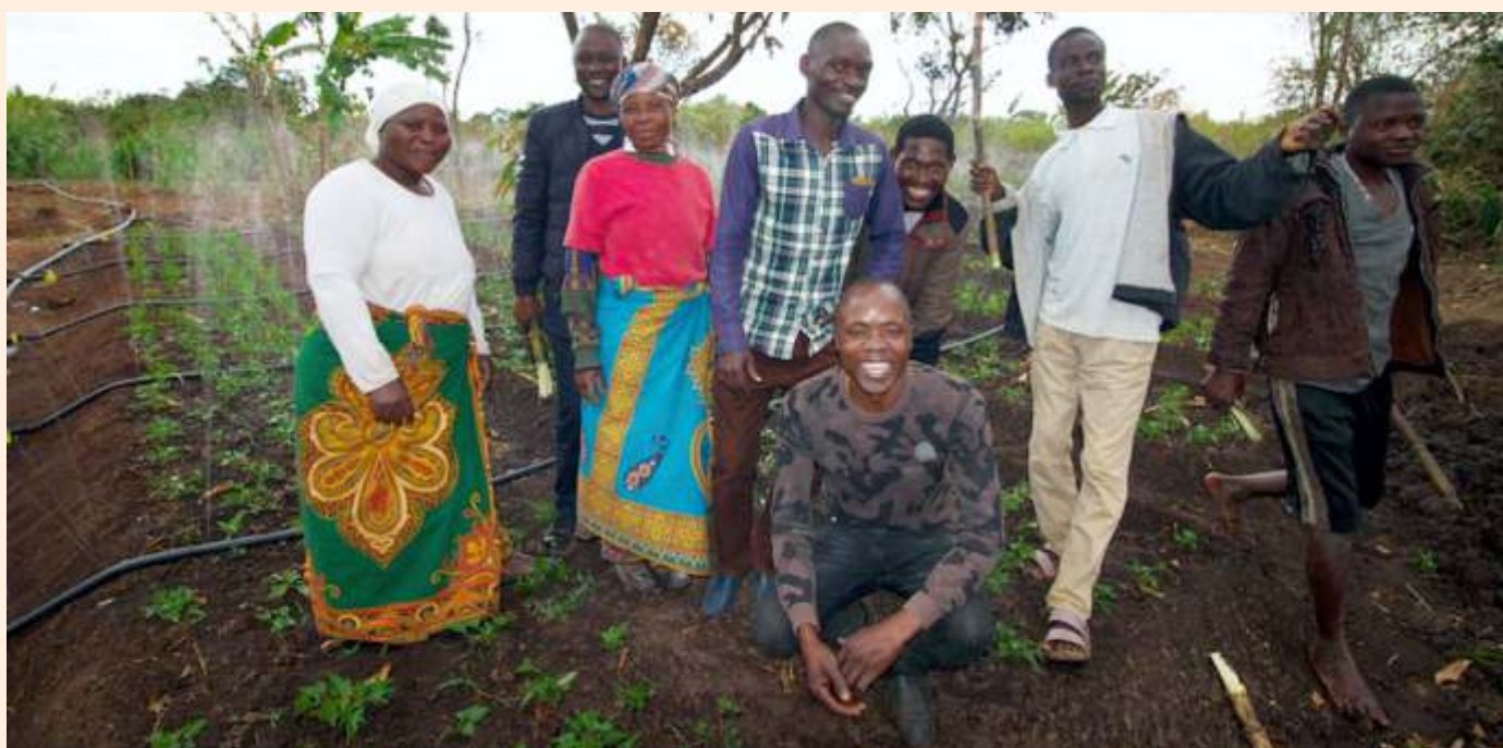
Farmers and team members of CIP and IWMI celebrate the development of irrigation facilities that enables OFSP vine producers to increase productivity and quality of produce

Personal financial resources and stable demand from the market and other issues will be discussed during anticipated innovation platform meetings.