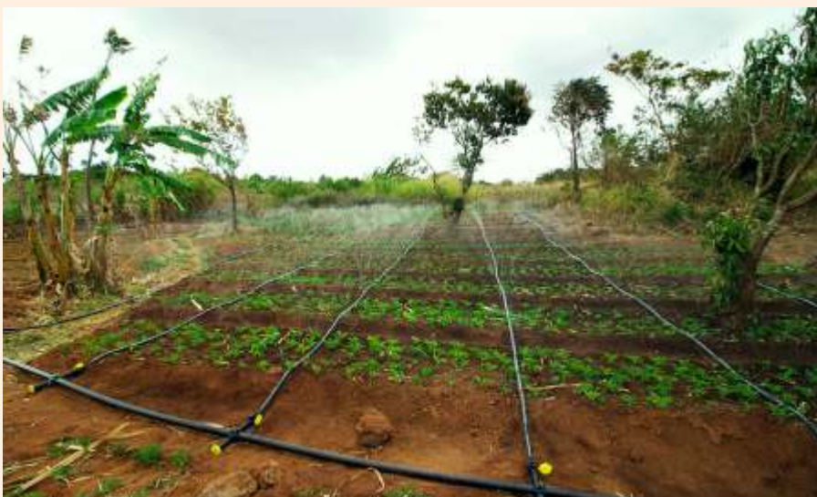
OFSP vines being watered with rain hoses; a low-cost water solution for efficient water distribution.

agronomic recommendations in combination with appropriate irrigation technologies are showcased as a solution to boost productivity and generate stable income to farmers.