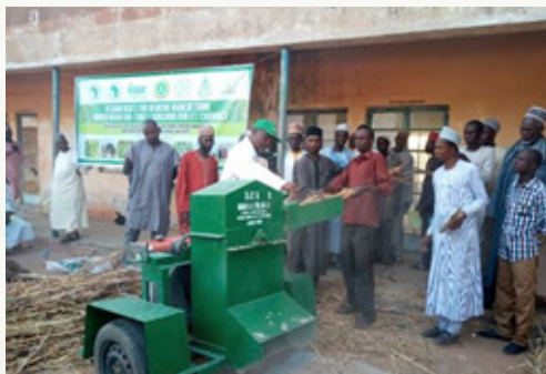
Sorghum and millet stover processed as animal feed: Demonstration of stover chopper