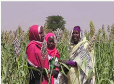
Al-Amel Agricultural Women group Society in Ed Elfursan: South Darfur State in Sudan

“during growing season our group received seed extension services from research and extension personnel. Our group produced about 7 tons of quality declared seeds. It is an important breakthrough for the group to start our business. Now our goal is to promote our quality declared seed to NGOs in the state to sell it at premium price. The focus is to grow and to increase agricultural business activities in near future”.