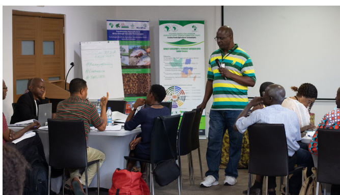
Representatives of TAAT compacts lining up to present their modular designs of Outreach Materials during CDTO workshop on #Packaging4Scaling

During the COVID19 pandemic period, CDTO is managing a series of technical webinars to feature the process of commercialization of a proven technologies from each commodity compact, especially among women-led and youth-led agri-enterprises. Discussions are facilitated, on the CDTO electronic discussion forum and community of practice. The CDTO online community has now reached over 1300 members who have been directly involved in TAAT activities (TAAT_CDTO on Dgroups)