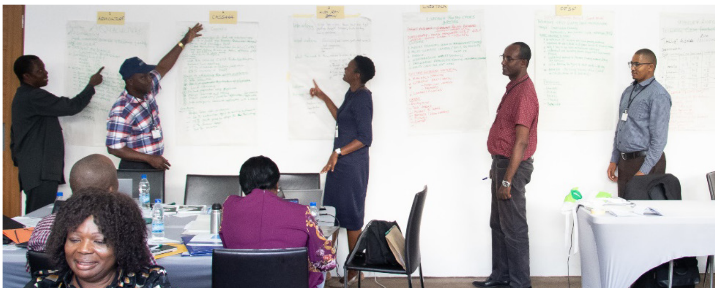
Researchers and Extensionists developing a standard template for outreach materials for use within TAAT