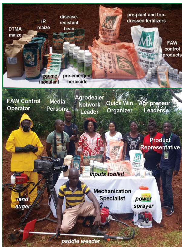
Figure 1. Quick Win 1 toolkit products (above) and dissemination team (below)

This Quick Win builds upon the widespread but underperforming farmer traditional maize-bean intercropping systems of west Kenya. It is conducted in conjunction with the Maize, Bean, FAW and OFSP Compacts. A modernizing toolkit was designed, commercial products assembled and a mechanism for product testing and sales initiated. This maize-bean-FAW-OFSP toolkit consists of pre-emergent herbicides, pre-plant and top-dressed fertilizers, improved maize and bean seed, legume inoculant, and FAW control products (Figure 1). These products were purchased through commercial bids and assembled at the OSSOM Agrodealer Network warehouse in Luanda, west Kenya. Member agrodealers met to become familiarized with the toolkit products, and means of product demonstration and testing were devised. After signing a partnership agreement with OSSOM these products were dispatched to six