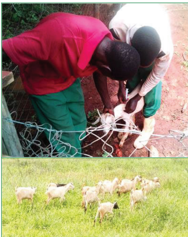
Figure 5. Injecting young goats (above), wet season grazing of improved breeds (below).

The KHYG team has also established a goat fattening enterprise, constructed animal pens and purchased the first 15 “Gala” breed goat kids for fattening. This breed of white goat is well known in Kenya for the quality of its meat and its resistance to disease (Figure 5). Each goat was