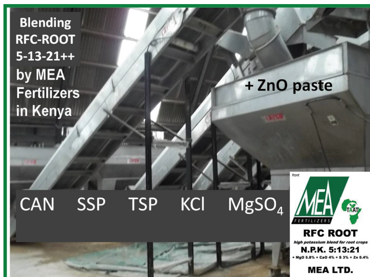
Figure 7. Blending the RFC-ROOT fertilizer by MEA Ltd. In Nakuru, Kenya (inset: fertilizer bag design).

operates a fertilizer blending plant in Nakuru, Kenya and distributes its products throughout East Africa (Figure 7). To date, a NPK 5:13:21 with MgO 5.8%, CaO 4%, S 3% and Zn 0.4% blend was formulated based upon locally available ingredients and MEA was contracted to produce the first 40 ton batch, matching the capacity of its smallest blender. A product label was designed and East Africa Bagging (EAB) was contracted to produce an assortment of 5, 10, 25