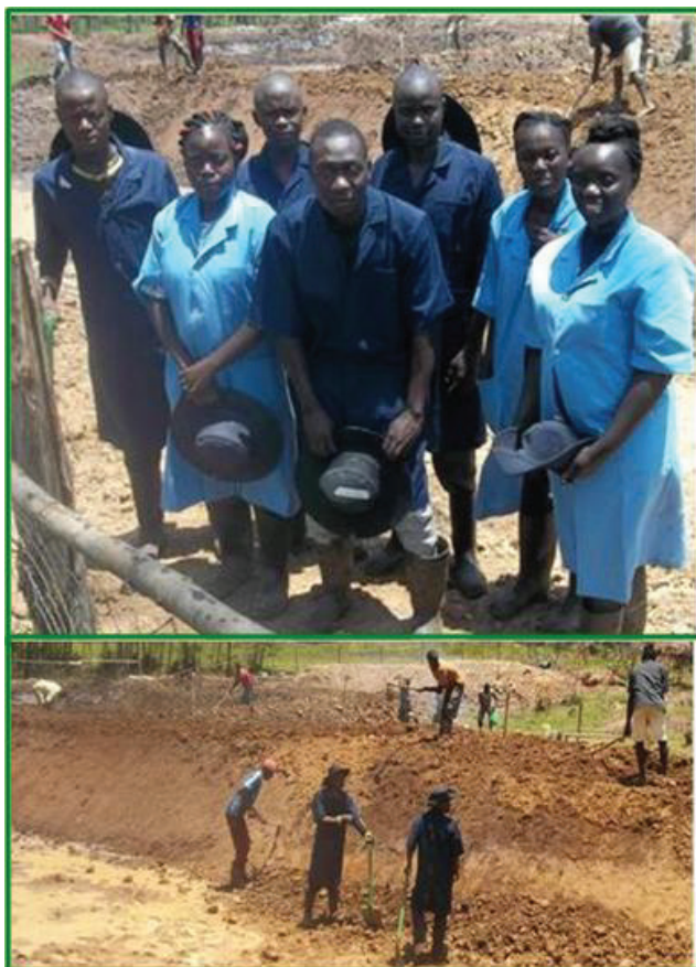
Figure 6. Members of an “Aquapreneur” youth group in west Kenya (above) and constructing fish ponds (below).

Quick Win 5. Innovative Fish Farming by the Vihiga Aquapreneurs. This action has resulted in the establishment of a new Agripreneur agribusiness incubation in west Kenya, the West Kenya Youth Agripreneur Group (Figure 6). This incubation is hosted by the Vihiga County Fish Farming Project to provide experiential learning in pond construction, fish farming, fish feed production and value addition. They are also producing Orange Fleshed Sweet Potato and High Iron Beans. The group includes 15 members and has registered with the Ministry of Social Services. AWE Ltd. offers mentorship in business development and marketing. The group is currently developing a complex of seven fish ponds totaling 2,100 m 2 able to produce 25 tons of fish worth $38,000 every six months. The group will also provide contract support to 120 neighboring fish farmers under funding from ENABLE TAAT. It recently presented a comprehensive agribusiness plan to the ENABLE TAAT Compact and was awarded an additional $15,000 by Ekimiks Ltd. to further its efforts. The group leaders subsequently received Agripreneur orientation by ENABLE TAAT officers concerning reporting procedures. This Quick Win serves as an example of how motivated youth may be quickly and cost-effectively mobilized toward enterprise development, and how this process may be linked to both private sector mentorship and local (county) government development efforts.