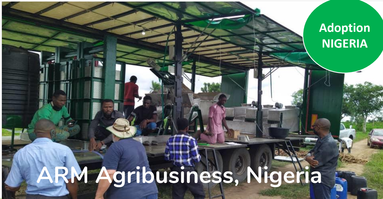
ARM Agribusiness, Nigeria

There have been interests to adopt the technology or actual investments in many countries.